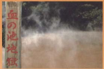
Blood Bond Hell

Kusasenri Meadow - Kusasenri is a grassy meadow in the flattened crater of an ancient volcano, and looks like a huge plate. There is a watering hole in the middle where livestock come to drink.