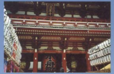
Asakusa Kannon Temple

Yokohama Toy Museum - There are more than 16,000 antique toys made from 1890 to 1960 on exhibit. This museum draws the young and the old alike. You may also find some favorite toys here.