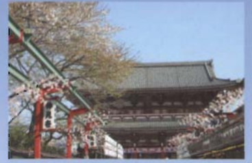
Nakamise Shopping Arcade