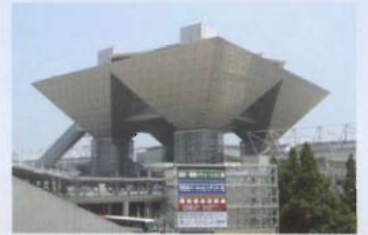
Odaiba Pallete Town